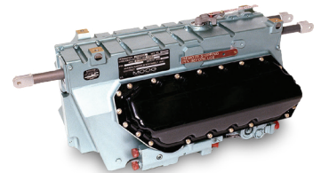
Aileron Rudder Interconnect