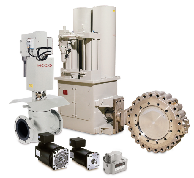
All Moog repairs and exchanges carry our "as new" warranty. We warrant every component for two years just as if it were purchased brand new.

Our lean production innovations allow us to provide the quality you expect from a major corporation with the speed of a smaller repair shop. With Moog you truly get the best of both worlds.