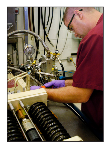
Test: Technician working on finished actuator on test bench to assure it meets or exceeds original OEM specifications before sending it back to customer