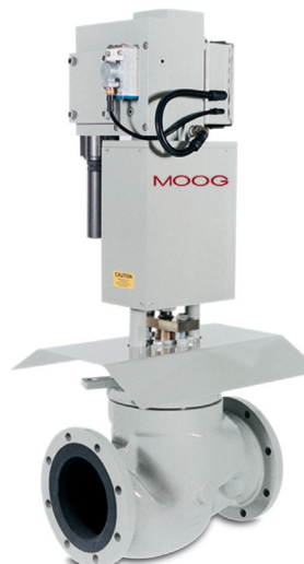
80 Series Traditional Hydraulic Actuator

Moog has offices around the world. For more information or the office nearest you, contact us at: